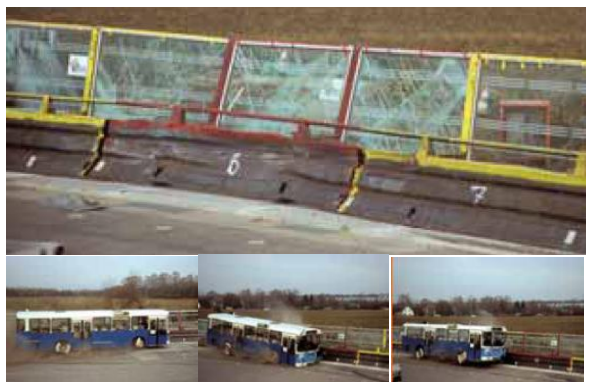
Figure 4. 13,000-kg 70 km/hr 20 degree intercity bus test of the MDS-4 barrier showing (top) barrier damage and (bottom) the vehicle-barrier interaction.