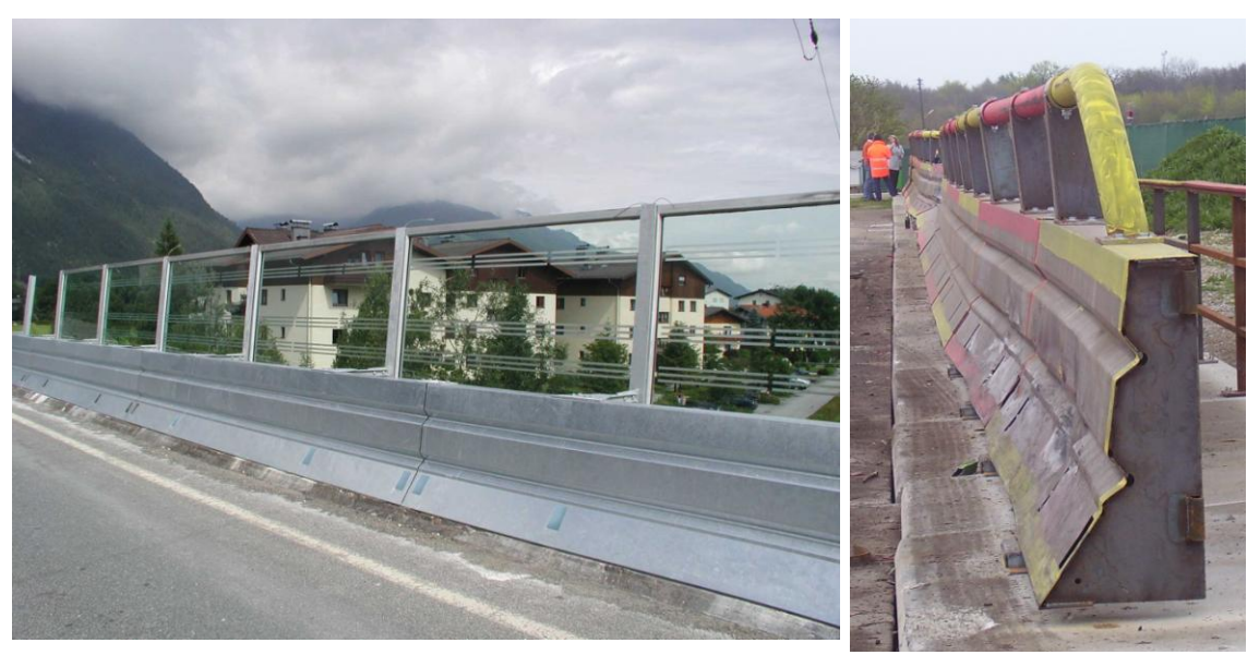
Figure 1. Photographs of the MDS-4 barrier with noise-wall installed (left) and a post-collision photograph of the MDS-5 barrier without the noise wall installed

The integration of both the safety barrier and the noise-protection barrier within a single barrier system provides considerable savings in terms of occupied space, supporting substructures and overall cost. The special backward positioning of the noise-protection barrier requires less lateral space on the bridge deck and also makes the disposal of snow easier.