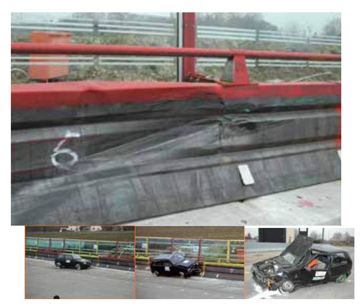
Figure 3. 900-kg 100 km/hr 20 degree small car test of the MDS-4 barrier showing (top) barrier damage, (bottom left and middle) vehicle-barrier interaction and (bottom right) vehicle damage.

The vehicle was smoothly redirected and the test satisfied all the evaluation criteria of both EN 1317 for TB-11 as certified by the test engineer. The test report and test data were used to re-evaluate the crash test according to Report 350 for test level 4-10 conditions. A summary of the Report 350 evaluation parameters are shown in Table 2 and photographs of the vehicle-barrier interaction, vehicle damage and barrier damage are shown in Figure 3. As demonstrated by the data in Table 2, the small passenger car crash test satisfied all the requirements of Report 350 and the testing conditions, as described earlier, are essentially the same for the European test TB-11 and Report 350 test 4-10. The MASH evaluation criteria are essentially the same as the Report 350 criteria for test 4-10. The exceptions are that more detail is provided for measuring occupant compartment intrusion (i.e., criterion D), the allowable roll and pitch are limited to 75 degrees in MASH (i.e., criterion F) and Report 350 criteria K and M are eliminated. As detailed in the test report, there was some minor damage to the floor pan but it was not extensive so the revised criterion D is not affected. The maximum roll and pitch angles were approximately 40 and 36 degrees respectively so the new criterion F was likewise not affected. The evaluation of