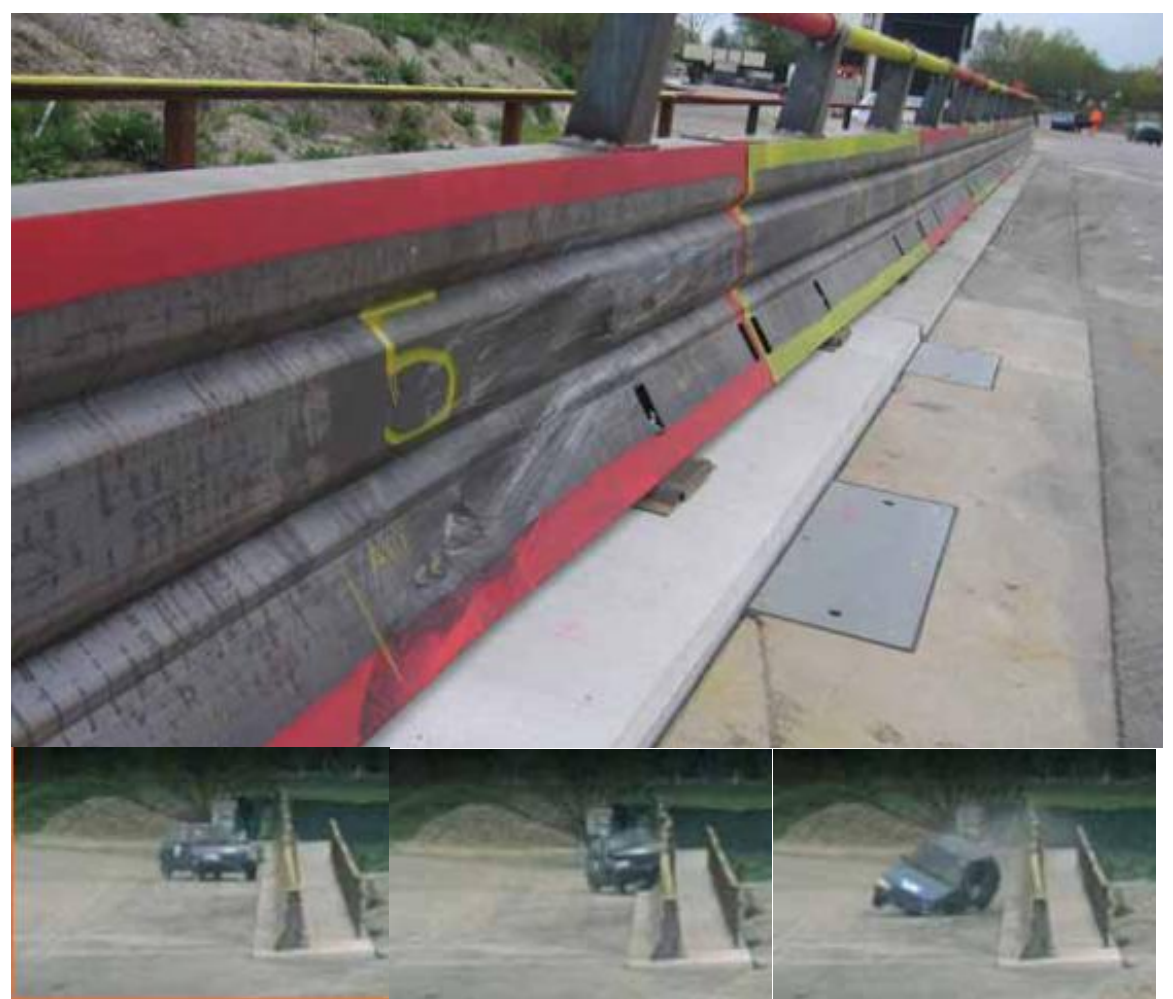
Figure 5. 900-kg 100 km/hr 20 degree small car test of the MDS-5 barrier showing (top) barrier damage and (bottom) the vehicle-barrier interaction.