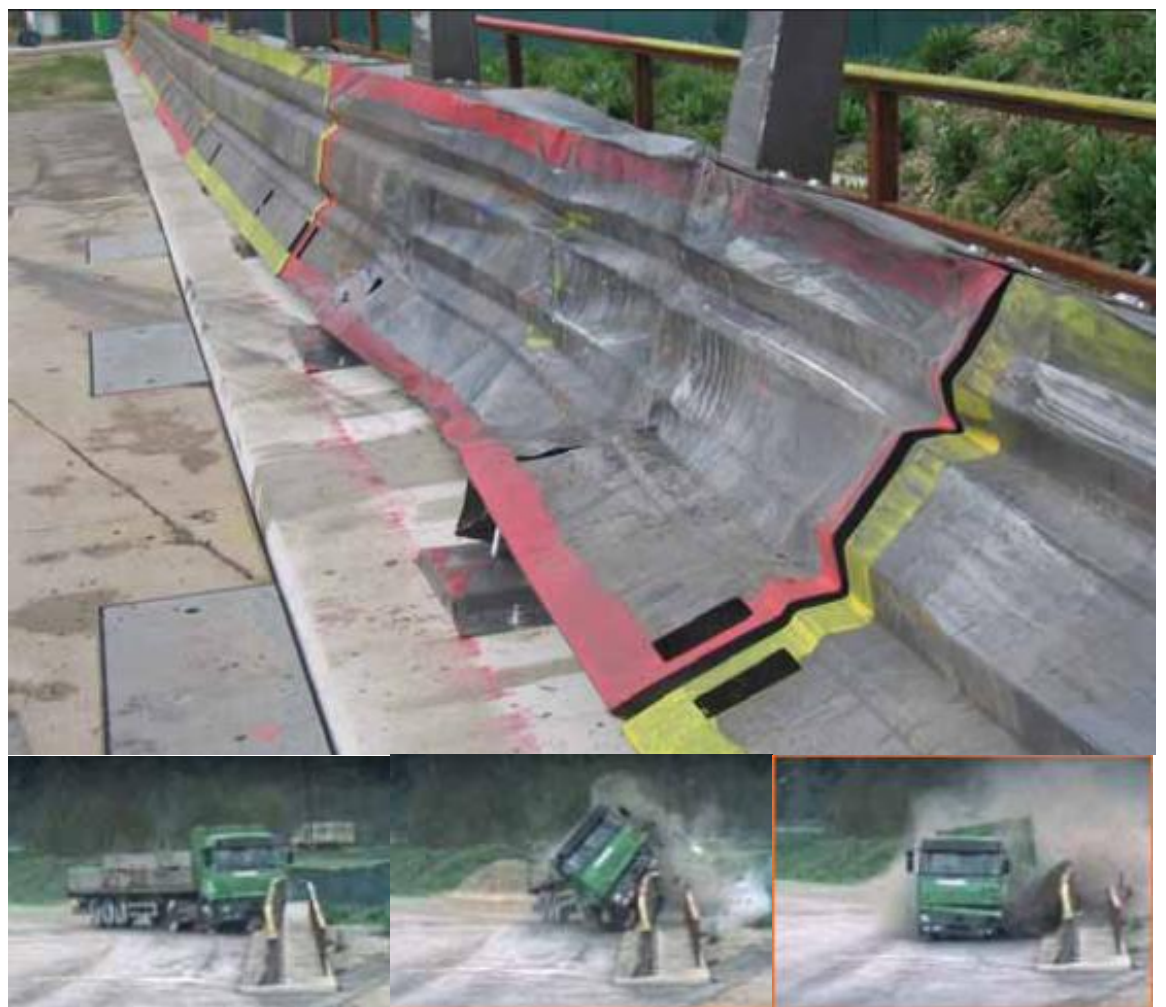
Figure 6. 38,000-kg 65-km/hr 20-degree tractor trailer truck test of the MDS-5 barrier showing (top) barrier damage and (bottom) the vehicle-barrier interaction.