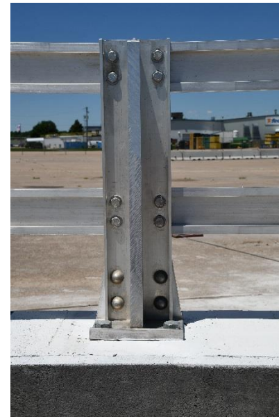
Figure 31. Post and Rail Assembly, Test Nos. NCBR-1 and NCBR-2