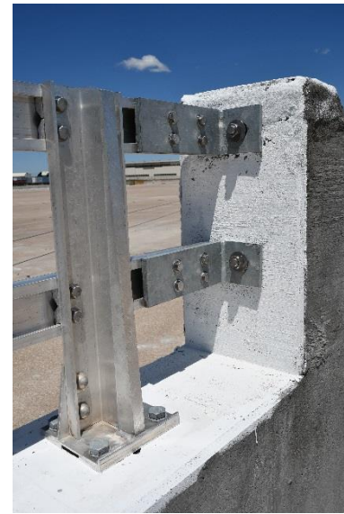
Figure 33. Rail End Anchorage Details, Test Nos. NCBR-1 and NCBR-2