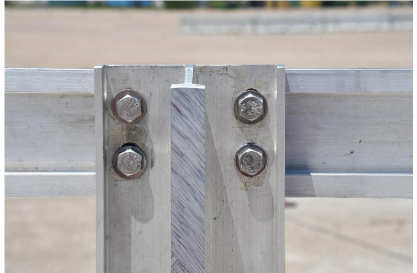
Figure 32. Post-to-Parapet and Post-to-Rail Attachment Details, Test Nos. NCBR-1 and NCBR-2